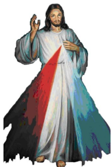
JESUS, I TRUST IN YOU.