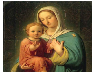
MARY: God's Yes to Man John Paul II's Encyclical Redemptoris Mater Introduction by Joseph Cardinal Ratzinger Commentary by Hans Urs von Balthasar IGNATIUS

Enter your email and create a password (you need this to login later)