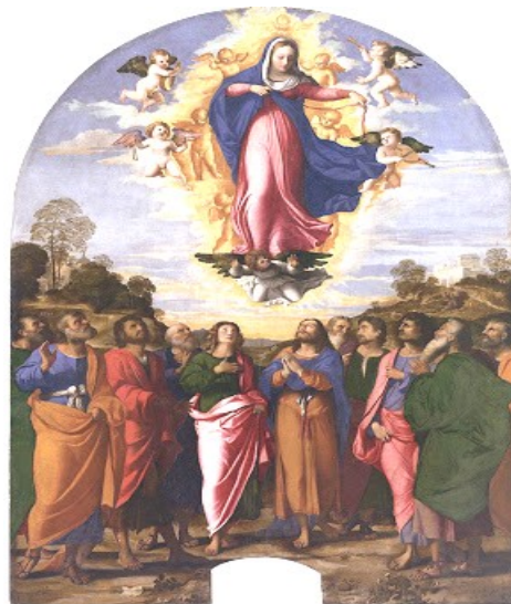
The Assumption of the Blessed Virgin Mary (Holy Day of Obligation)

Did you know that our parish offers Online Giving, a web-based electronic contribution application. We are providing this service so that you have the option to manage your contributions online or with your offering envelopes. This service is safe and secure. And it is convenient for you and for our parish staff. Sign up for Online Giving by visiting our parish website at www.stfranciswakefield.com and selecting the Online Giving link.