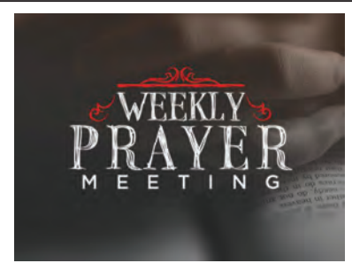
THURSDAY EVENING PRAYER MEETING

chapel so that they can assist those in need in our area (Gift cards are accepted). If you know of someone in need of assistance, SVDP can be reached at 401-871-8936. Please keep them in your prayers!