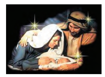
Christmas Day Mass Schedule Saturday, December 25 At St. Francis Church 9:00am (to be streamed) & 11:00am